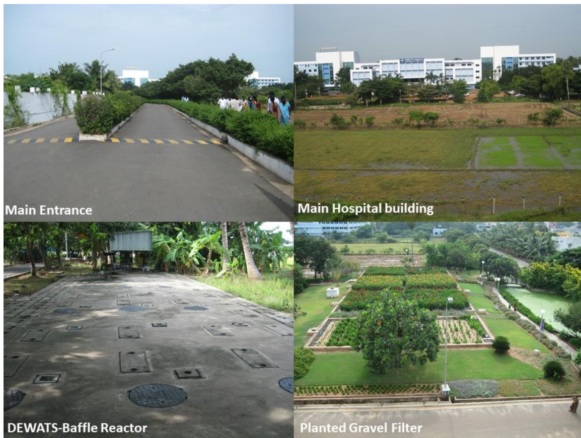
Figure 1: View of Aravind Eye Care Hospital and the decentralized system.

During the construction of the hospital in 2003, it was then decided to install a water recycling system, which will help reduce waste, and water consumption. But instead of opting for a conventional centralized treatment plant, the hospital management installed a decentralized wastewater treatment system called the DEWATS.